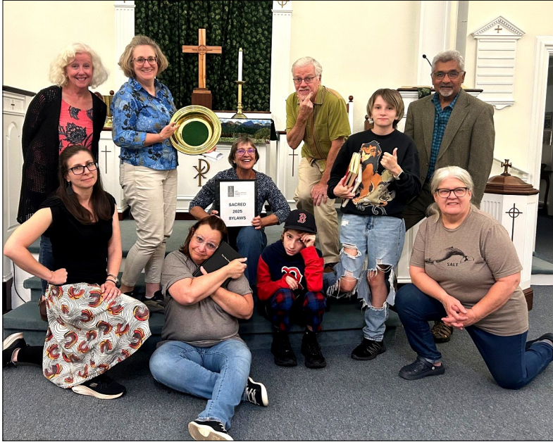
The Cast Rehearsing Diligently

Nutrition = Healthy Body, Giving = Healthy Church!