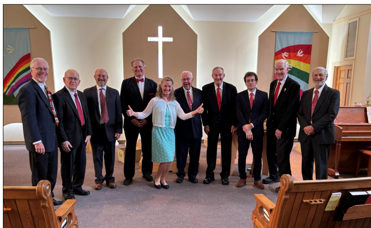
Men At First in Jeffersonville—8/24/25

Encourage your children to participate and enjoy the blessings of their church and local community!