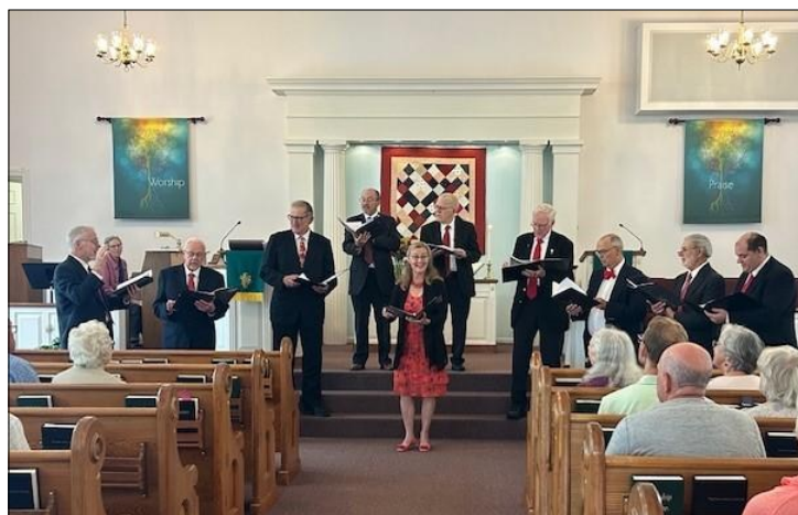
Men At First in South Hero—6/29/25