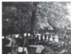
Emmaus UCC/VOICE public gathering