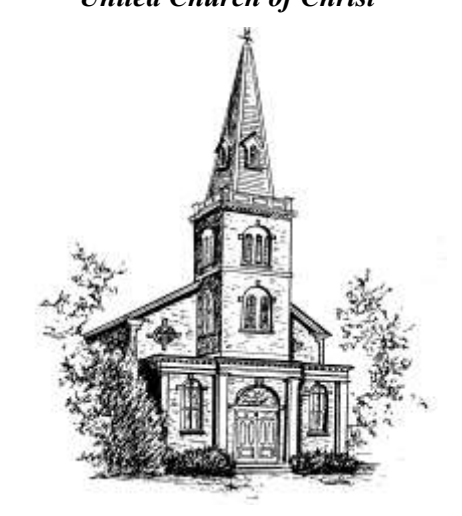
A Welcoming Community, Accepting and Serving All in the Spirit of Christ

The First Congregational Church of Essex Junction, United Church of Christ, is an Open and Affirming congregation, embracing diversity and affirming the dignity and worth of every person, because we are all created by a loving God. We seek to live Christ's call for compassion, justice, healing and wholeness in life. Therefore, we welcome into our community persons of every race, gender, age, sexual orientation, faith background, nationality, ethnicity, marital status, mental and physical ability, economic and social position, gender identity and expression, level of education and family structure. We invite all to share in the life, leadership, ordained ministry, lay ministry, worship, sacraments, responsibilities, fellowship, blessings, and joys of our congregation as we seek to grow together in faith and love.